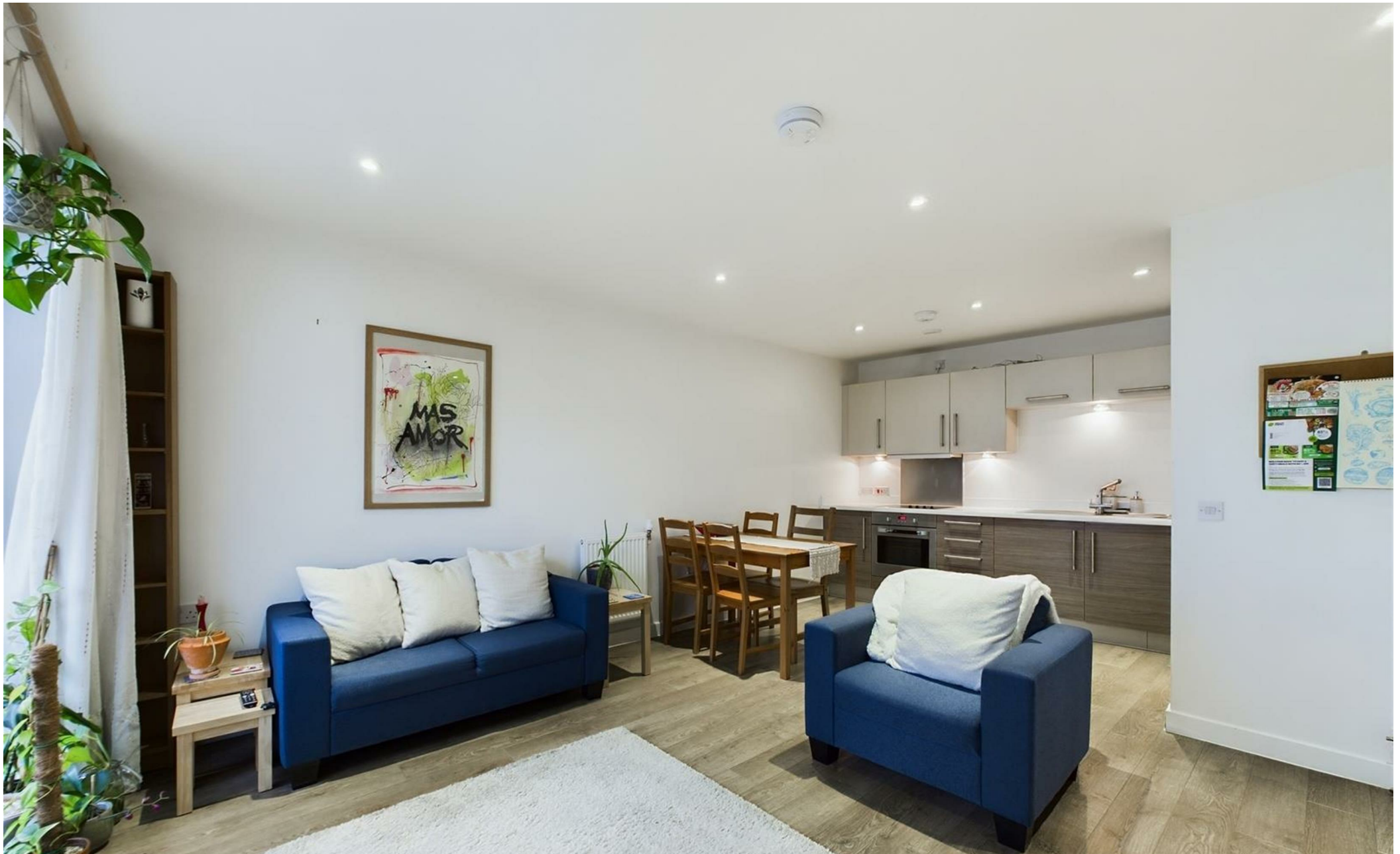
510, Casson Apartments 43 Upper North Street, New Festival Quarter, Canary Wharf, London, E14 6FY £425,000